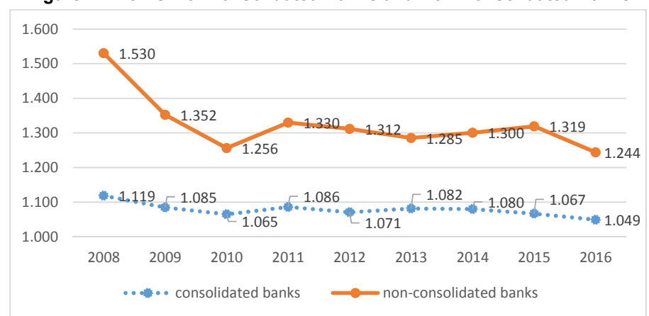
Figure 2. The TGR of Consolidated Banks and Non-Consolidated Banks